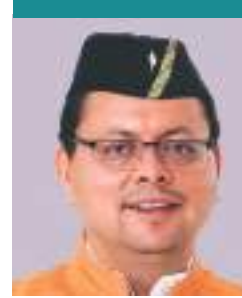
Shri Pushkar Singh Dhama Chief Minister of Uttarakhand

MINISTER'S BLOCK, SECRETARIAT COMPLEX, PORVORIM, UTTARAKHAND , 403 521, INDIA PH: 0832-2419841/42 FAX: 0832 2419840/46 Email: cm.goa@nic.in