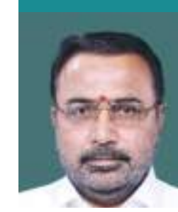
Shri Prataprao Ganpatrao Jadhav Minister of State, (Independent Charge) Ministry of AYUSH & Ministry of Health and Family Welfare